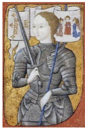
Joan of Arc